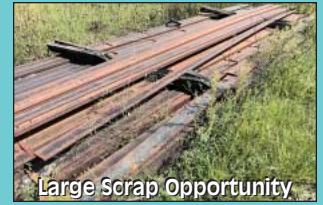
Large Scrap Opportunity