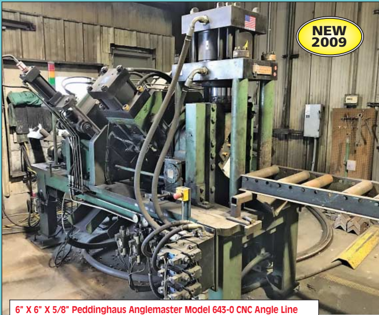
6" X 6" X 5/8" Peddinghaus Anglemaster Model 643-0 CNC Angle Line

SALE DATE: WEDNESDAY, JANUARY 23RD, STARTING AT 9:00 AM CST INSPECTION: TUESDAY, JANUARY 22ND, FROM 10:00 AM TO 4:00 PM