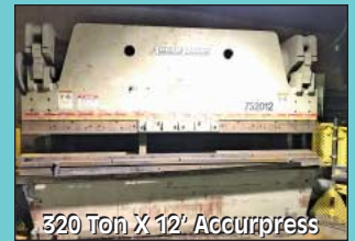
320 Ton X 12' Accurpress