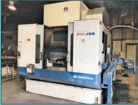
Daewoo Model DVC-500 CNC Vertical Machining Center