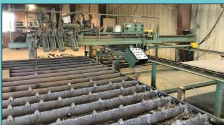
8' x 20' L-TEC CM-250 6-Head Burning Table