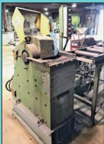
196 Ton Franklin Model No. 908200 Hydraulic Notcher