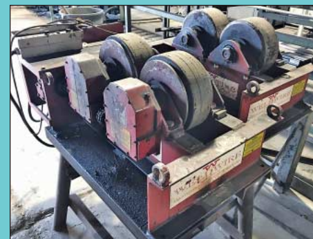
(4) Sets of 5 Ton Weldwire Model WWRD-10SF Power Turning Rolls

Large Quantity of Scrap Including Steel Sheets, Bar Stock, Flat Stock