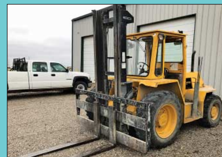
10,000 Lb. Sellick Model SD-100 Diesel Pneumatic Tire Lift Truck