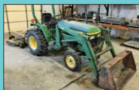
2000 Ford F550, 2001 Chevy 2500, John Deere 770 Tractor