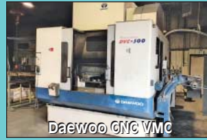
Daewoo CNC VMC