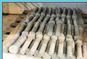
Large Quantity of New Tower Components and Parts including Gin Poles, Fabricated Tower Sections, Guyed Towers, Self Supporting Towers, Monopoles, Etc.