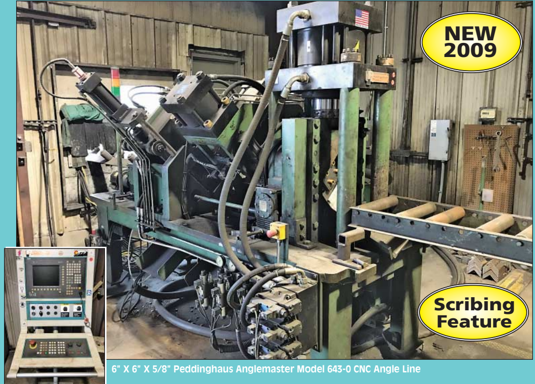
6' X 6' X 5/8' Peddinghaus Anglemaster Model 643-0 CNC Angle Line