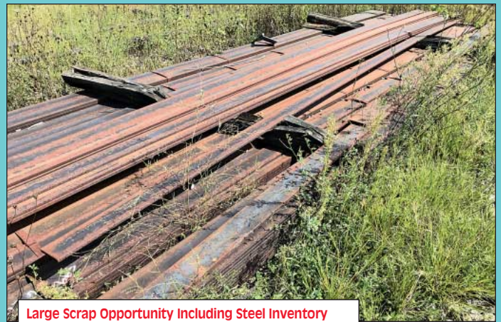
Large Scrap Opportunity Including Steel Inventory