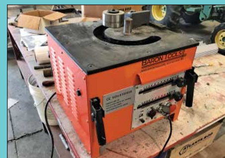
Barron Tools Model RB-25 Rebar Bender