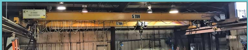
(2) 5 Ton x 37' Approx. Span Kone Crane Single Girder Bridge Cranes w/ Six-Way Pendant