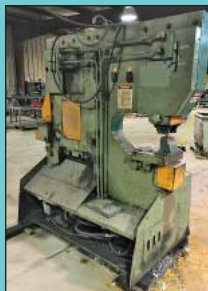
110 Ton Peddinghaus Peditmax 110/140 Hydraulic Ironworker