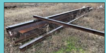
Large Quantity of Scrap Including Steel Sheets, Bar Stock, Flat Stock