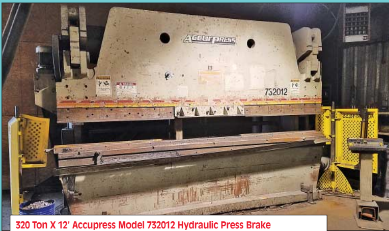
320 Ton X 12' Accurpress Model 732012 Hydraulic Press Brake