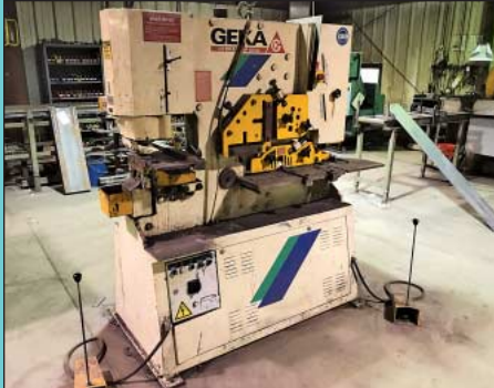
88 Ton Geka Hydracrop 80 Hydraulic Ironworker