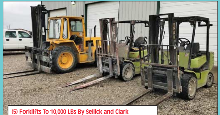
(5) Forklifts To 10,000 Lbs By Sellick and Clark