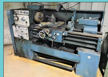
16" X 40" ENCO Model 111-1638 Engine Lathe