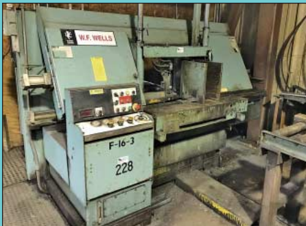
(3) Wells Horizontal Band Saws Up To 17" X 20"